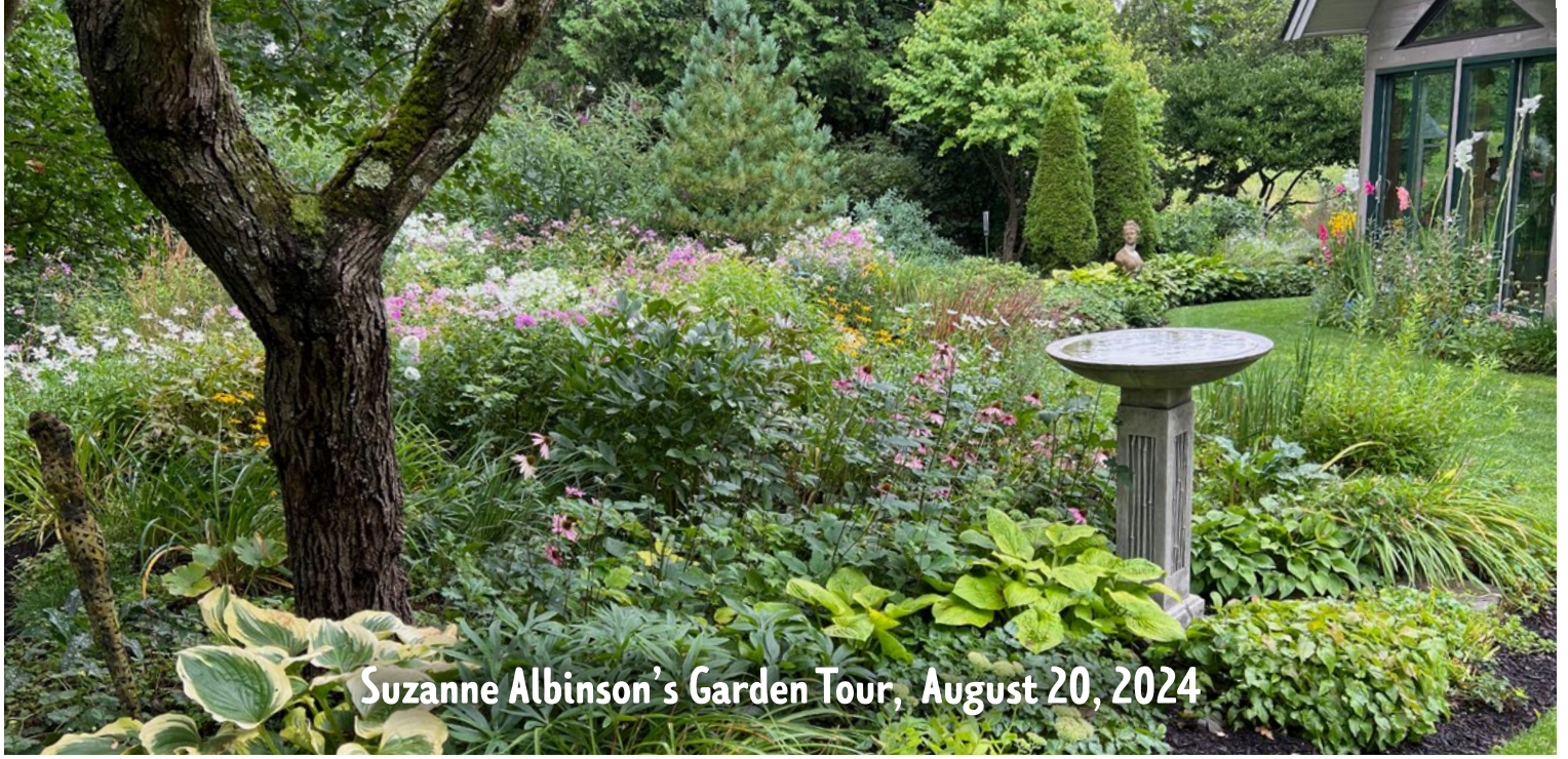
Suzanne Albinson's Garden Tour, August 20, 2024