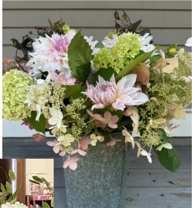
September arrangement done by Ginny Heidke.