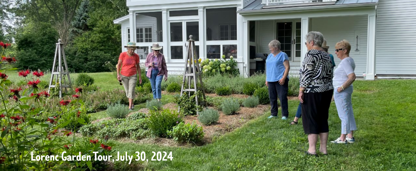
Lorenc Garden Tour, July 30, 2024